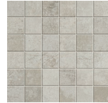
RIFT CHALK MOSAIC 11 3 / 4 "x11 3 / 4 " - 30x30 cm (Mosaic 2"x2")