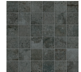
RIFT BLACKTOP MOSAIC 11 3 / 4 "x11 3 / 4 " - 30x30 cm (Mosaic 2"x2")