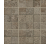
RIFT PORTLAND MOSAIC 11 3 / 4 "x11 3 / 4 " - 30x30 cm (Mosaic 2"x2")