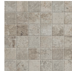
RIFT GRAVEL MOSAIC 11 3 / 4 "x11 3 / 4 " - 30x30 cm (Mosaic 2"x2")