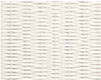
CRAFT 3D WICKER WHITE