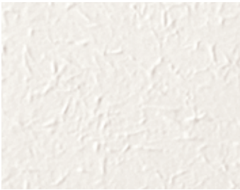
CRAFT 3D RICE